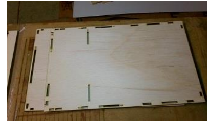
1 st and 2 nd Floors