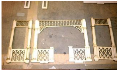
Porch rails 1A, 1B & 1C