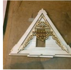
2 nd Floor Assembly 2A, 2B & Fretwork