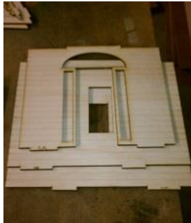
1 st Floor Walls 1A , 1E, & 1F