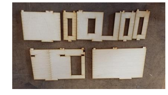
First Floor walls