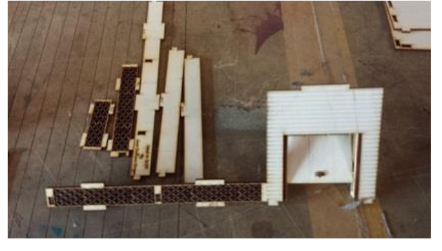
Subfloor and Garage assembly