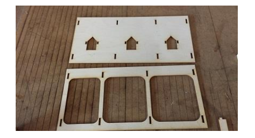
Front and rear roof