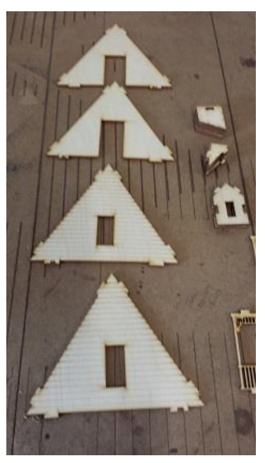
Second Floor walls