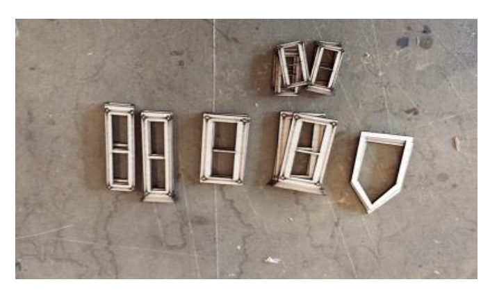
Window and interior frames