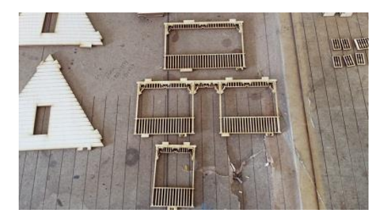
First floor porch rails