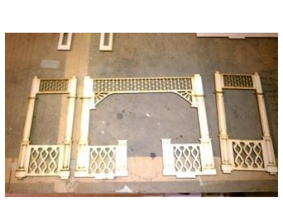
Porch rails 1A, 1B & 1C