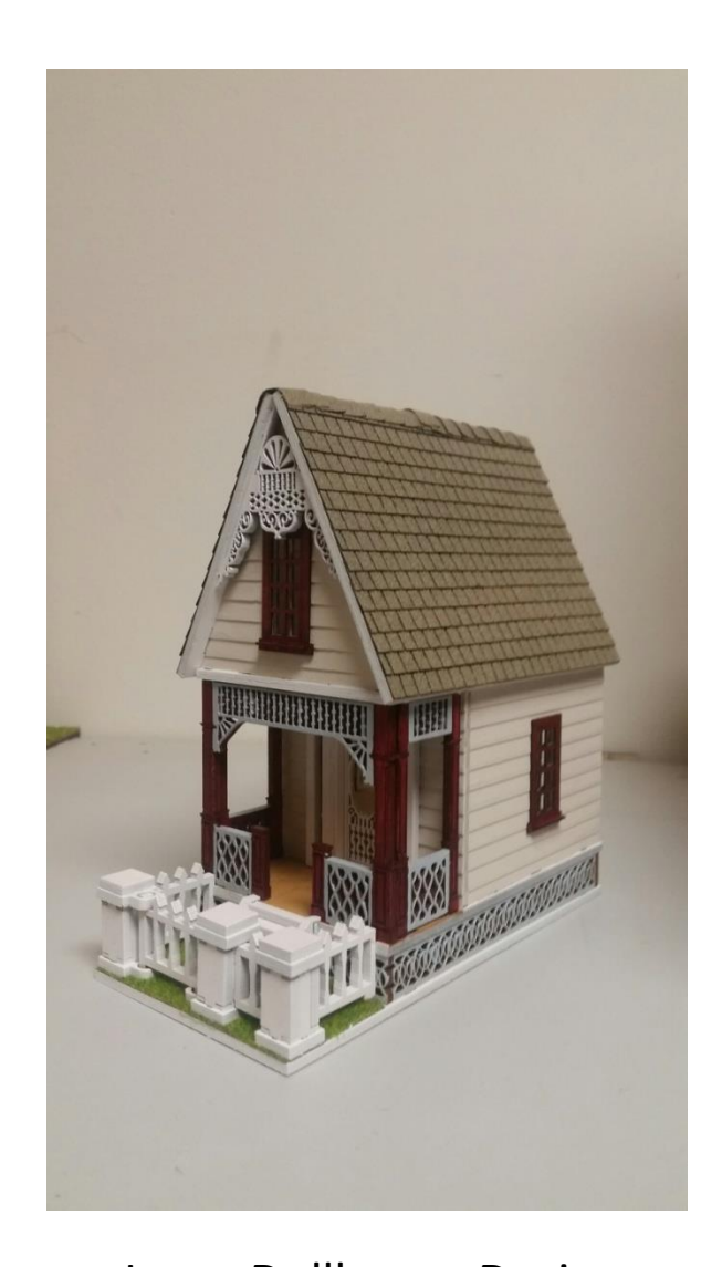
Laser Dollhouse Designs www.laserdollhouses.com