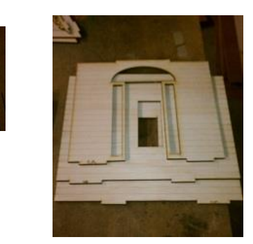
1<sup>st</sup> Floor Walls 1A , 1E, & 1F