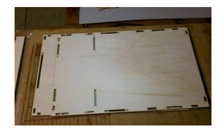
1st and 2nd Floors