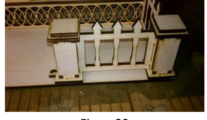
Figure 23 Figure 23