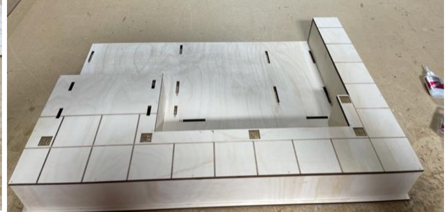
Figure 2 Figure 3