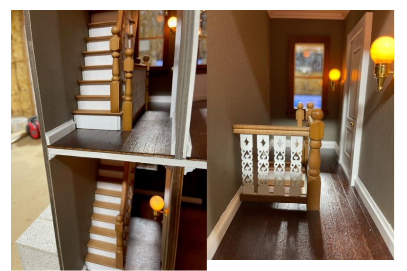
Figure 35 Figure 36 Figure 37