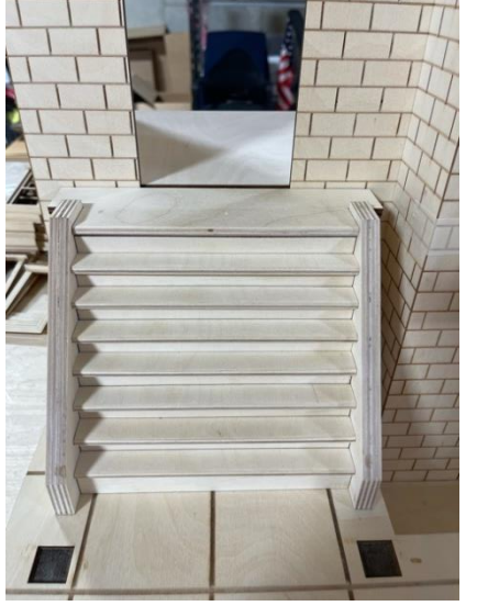
Figure 22 Figure 23 Figure 24